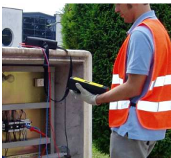
Signal injection in a power-box using the IC1G transmitter (TX)

Electric utilities and their contractors need to identify electric cables on service under certain circumstances: when opening a trench, when making branch circuits, before and after distribution network maintenance duties, etc. This identification has to be quick and unambiguous due to possible consequences (life threat, network failure, etc.) that could derive of choosing the wrong cable.