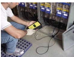
Cable identification in the LV output of an MV/LV transformer using the IC1G receiver (RX)

The IC1G Cable Identifier consists of a transmitter (IC1G-TX) and a receiver (IC1G-RX). The equipment is easy to use: the transmitter (TX) is connected to an LV distribution cable and the receiver (RX) is used to identify or locate that cable upstream, towards the MV/LV transformer.